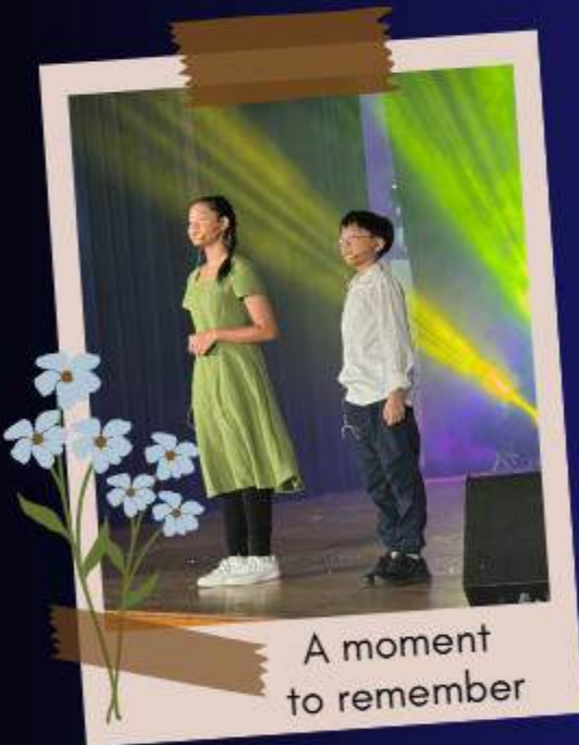
A moment to remember

There were times where I felt overwhelmed, but I reminded myself to be present and enjoy the moment instead of worrying too much. Ignite 25 truly pushed me out of my comfort zone. I will be forever grateful for the lessons and growth I have gained from it.