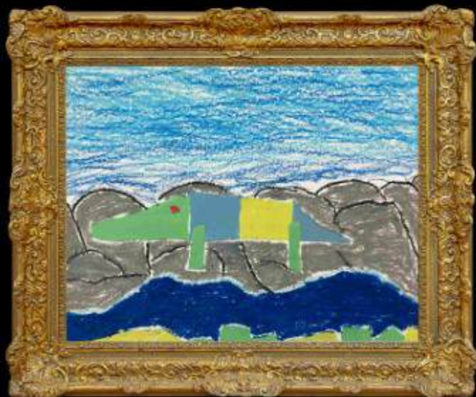
SHWE LOON WADDY HLAING, P2.6