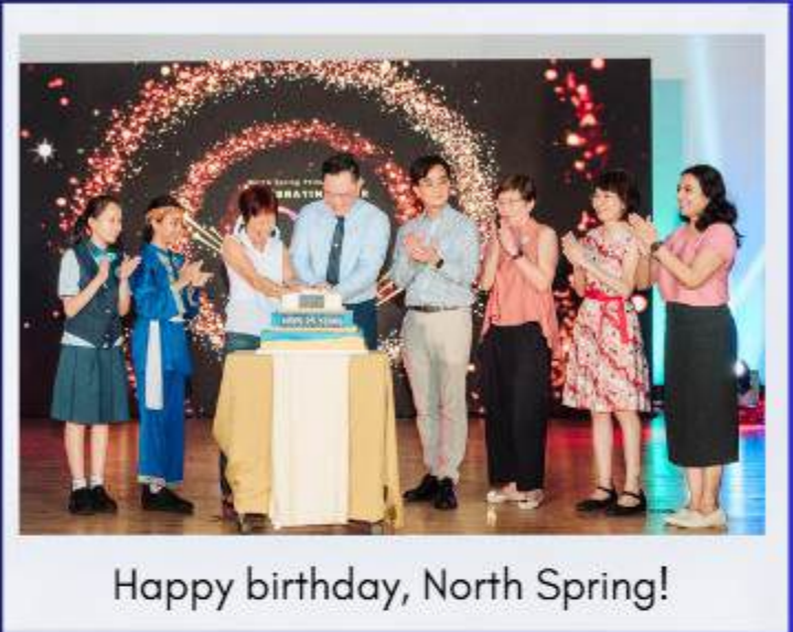
Happy birthday, North Spring!

However, certain skills were not easily learnt. I had to balance memorising lines, practicing my choreography alongside completing my group project. This experience tested my time management and self-discipline as I worked hard to complete everything.