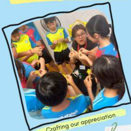
Crafting our appreciation