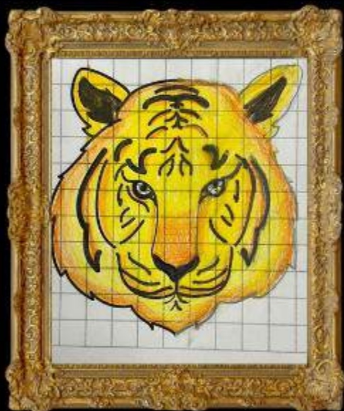
MOHAMED AIZATH BIN MOHAMED ASIK, P2.7